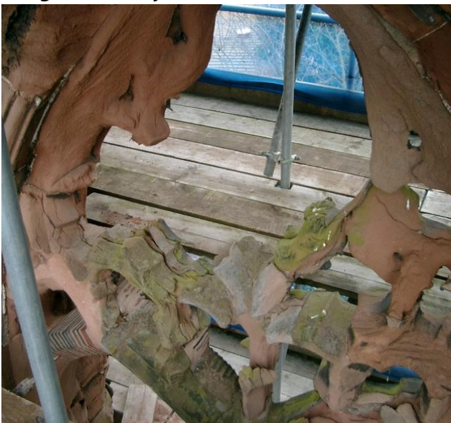
Original Tracery to Guesten Hall (Front view)